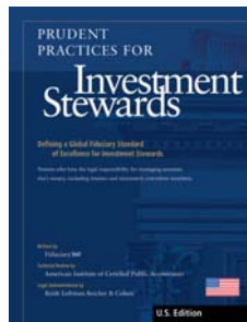
Prudent Practices for Investment Stewards